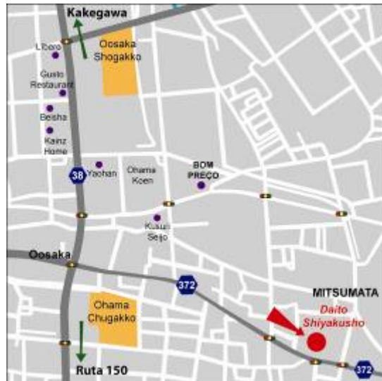
Biography Cycle Pavilion in Kakegawa City Office

Kakegawa City Office, Daito Branch (Daito City Community Center)